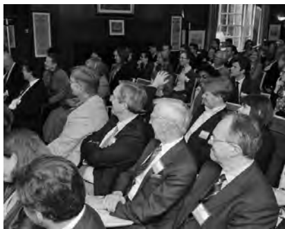
The Boston Seminar, Day One, Opening Session

The first day consisted of two plenary sessions devoted to the Dutch and American academic models and future policies. On the second day, working groups focused on specific topics including two in which American universities demonstrate strength and have much to offer their Dutch counterparts: innovation in education and attracting non-governmental funds for research. Studying in the United States is an attractive option for many Dutch academics, for instance