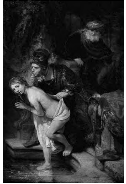
A Corpus of Rembrandt's Paintings: The Small Scale History Paintings (Vol. V) —Rembrandt Research Project Foundation, 2010

of Rembrandt, and intends to isolate Rembrandt's own works from the great volume of Rembrandt-like paintings, produced by his pupils and followers. The fourth volume (Springer 2005) was dedicated to Rembrandt's self portraits. The fifth volume is about the small-scale history and genre paintings. All kinds of artistic insights and skills played a role in the creation of this kind of work, especially in the history paintings. Systematic research into this little known area has revealed fresh understanding of Rembrandt's own way of thinking about painting, which makes Volume V a unique and innovative contribution to the history of art. A detailed comparison of Rembrandt's own work with that of his pupils provides a much needed access and comprehensive understanding to Rembrandt's own criteria regarding artistic quality.