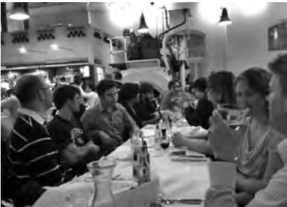
The NAF Alumni Committee and guests celebrating at Café Amsterdam

For next year, the committee plans to organize another dinner, the yearly barbeque and a cultural event. The committee's ongoing goal is to support the NAF's mission by building a strong network of former fellows in the Netherlands and organizing a mentor support system for incoming students, together with the Alumni Committee in New York. The NAF Connection will be held again, on both sides of the Atlantic, in March 2012.