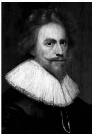
Willem Kieft